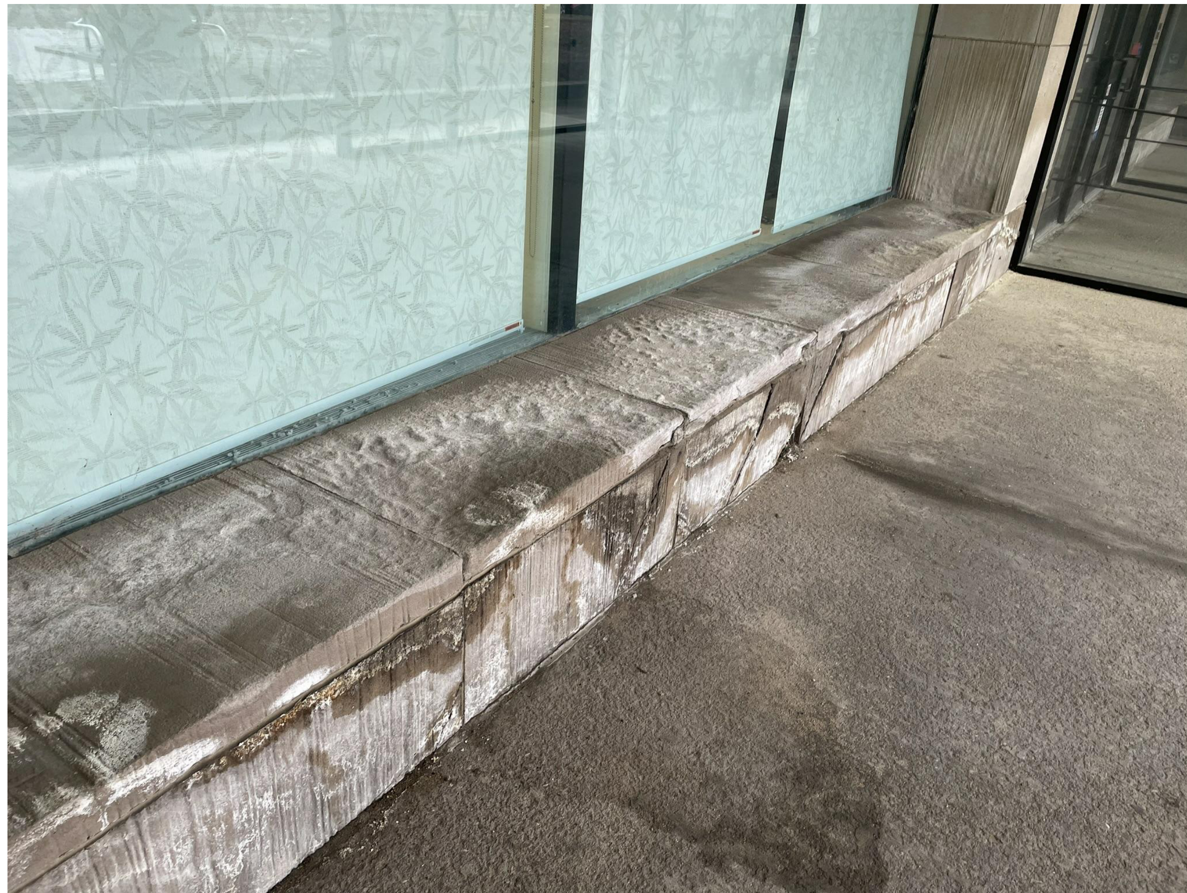
1 PHOTO - BENCH EXISTING