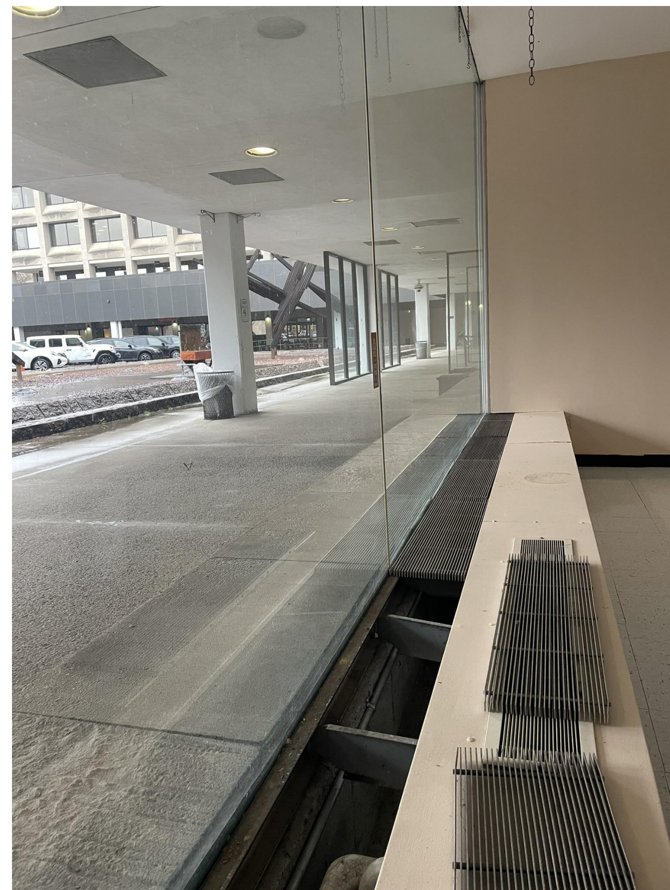
2 PHOTO - INTERIOR AT BENCH 1 1/2" = 1'-0"